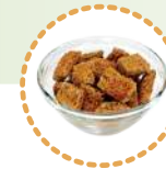
pieces of toast