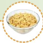
small pasta (pastina, stars)