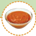
sweet potato mash