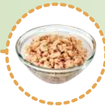
soft moist ground meat